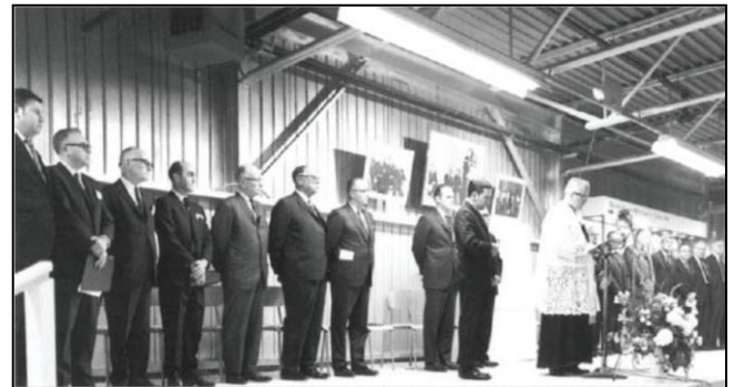
Powder Plant Inauguration Ceremony, October 1968

It can be seen that the metal powders was an ambitious project right from the start!